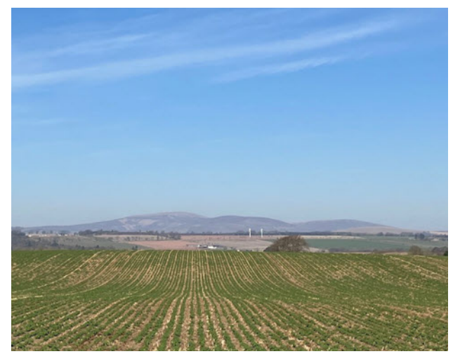
tatties just starting to appear

I always feel that the spring is a time of hope, do you? I think it's because we see more of the sun and we are surrounded by signs of new life all around. For us in Europe, that has all become very much part of our celebration of Easter, and symbols of spring flowers, new lambs and baby rabbits are as much a part of our cultural scene at Easter as are images of the cross or of the stone being rolled away. (Perhaps more so, these days!)