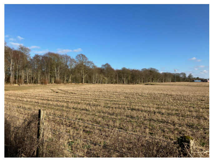
stubble field still fine for a walk!